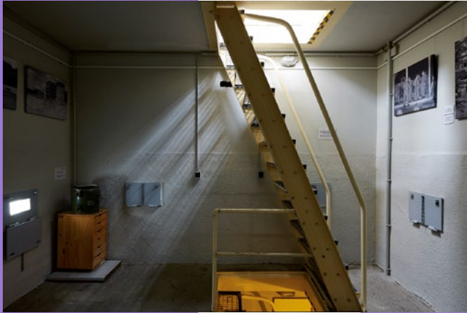
Inside the tower, 2019

The memorial at Kieler Eck exists in a former command post of the GDR border troops at the Berlin-Spandau ship canal. After the Wall fell, it was established as a memorial for Günter Litfin, one of the first victims of the Berlin Wall. It documents the border regime and bears witness to its victims.