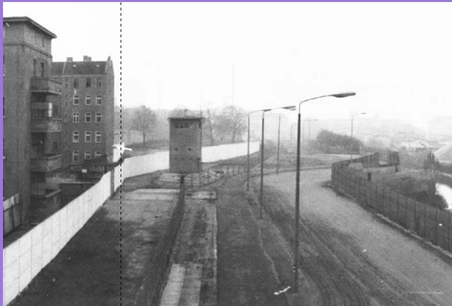
The command tower at Kieler Eck in the border strip, 1988