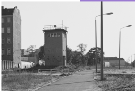
Former command post at Kieler Eck, 1990