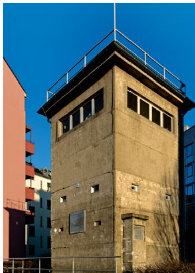
Günter Litfin Memorial, 2018